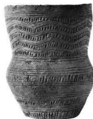
Example of a Beaker Folk beaker